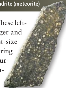
▶ Chondrite (meteorite)