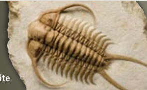
► Fossil trilobite

pounds. From space, Earth's continents two billion years ago might have looked something like Mars, albeit with blue oceans and white clouds providing dramatically colorful contrasts.